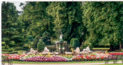
Beacon Park