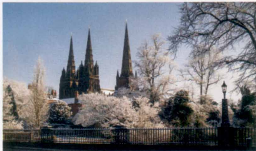
Lichfield Cathedral