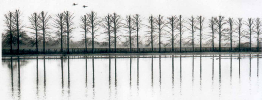
Skimming the Trees by Graham Slight