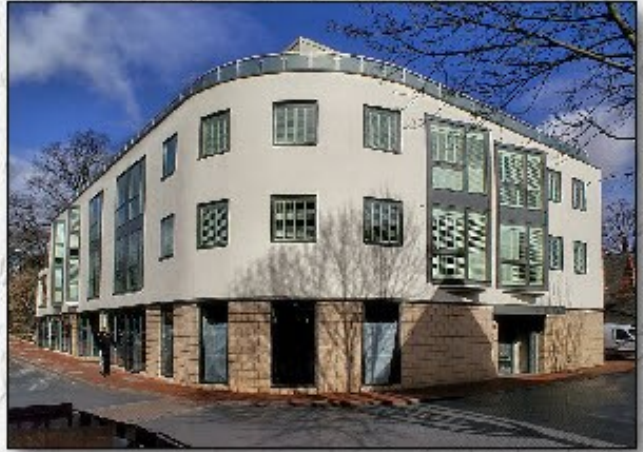
New Minster House (updated) - Colin Wiles