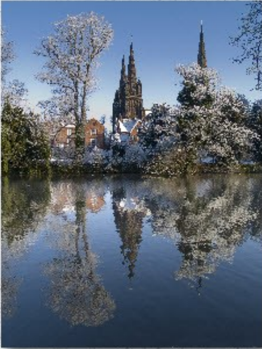
Lichfield Cathedral with snow