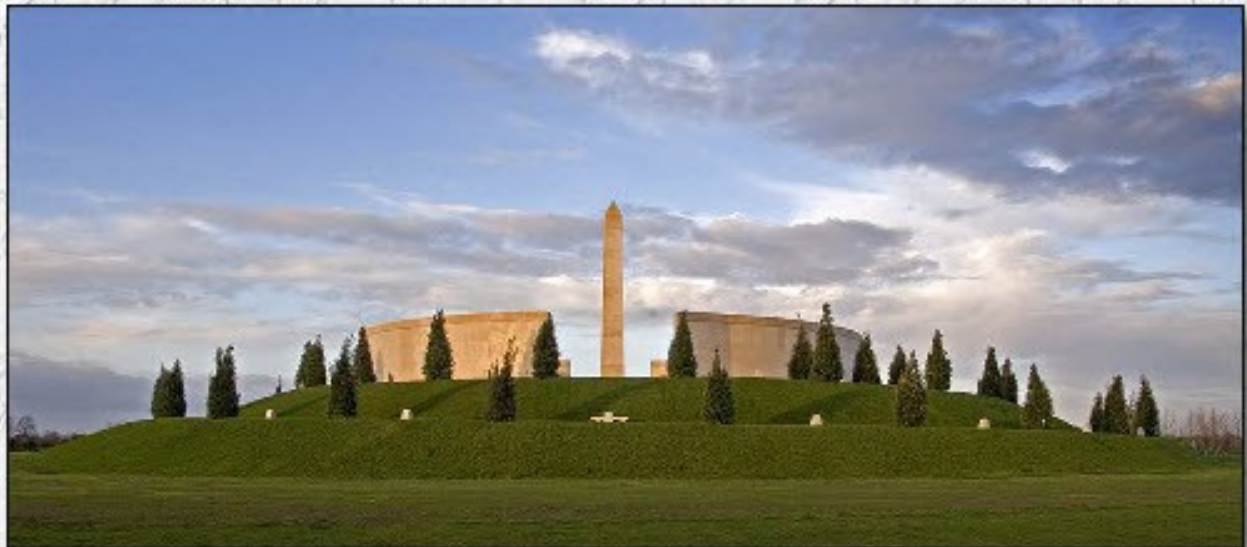
The Armed Forces Memorial - National Memorial Arboretum