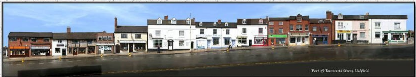
Tamworth St (upper) - Brian Hall