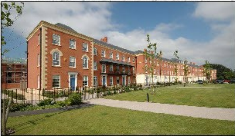
The Kensington Oval