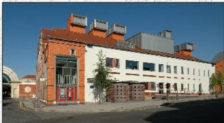
The Lichfield Garrick Theatre (updated)