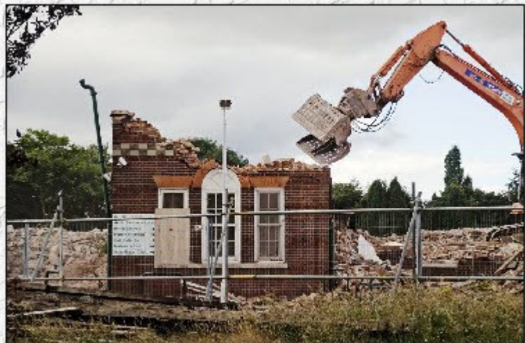
Demolition of the Victoria Hospital - Chris Lockwood