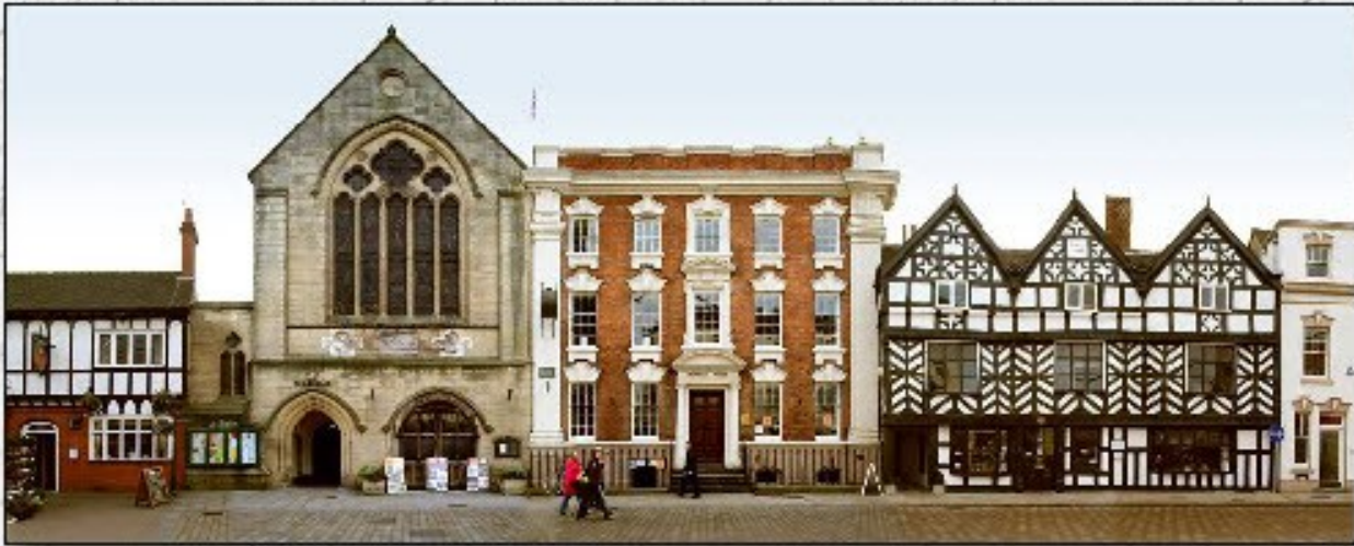
Bore Street Lichfield - Brian Hall