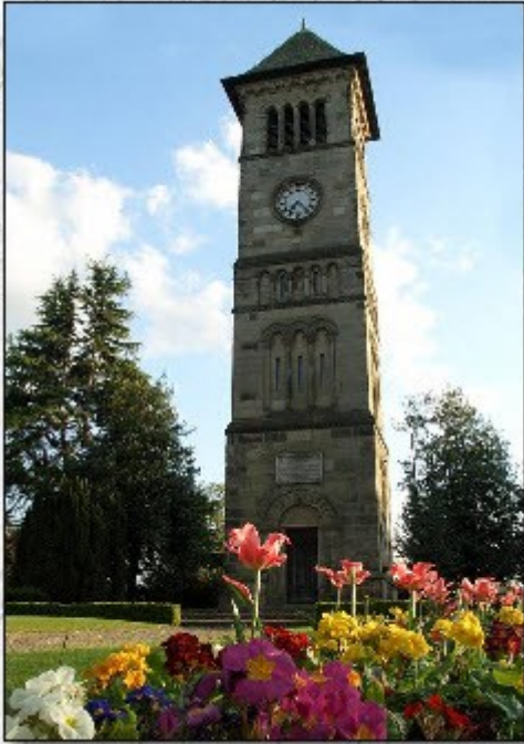
The Clock Tower - Alan Nicholas