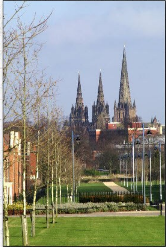
Cathedral View from Darwin Park - Arnold Jones